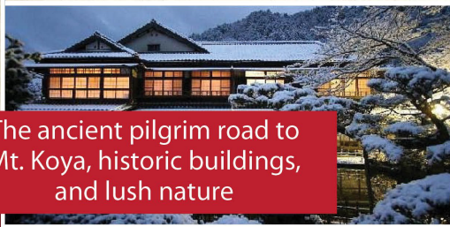
The ancient pilgrim road to Mt. Koya, historic buildings, and lush nature