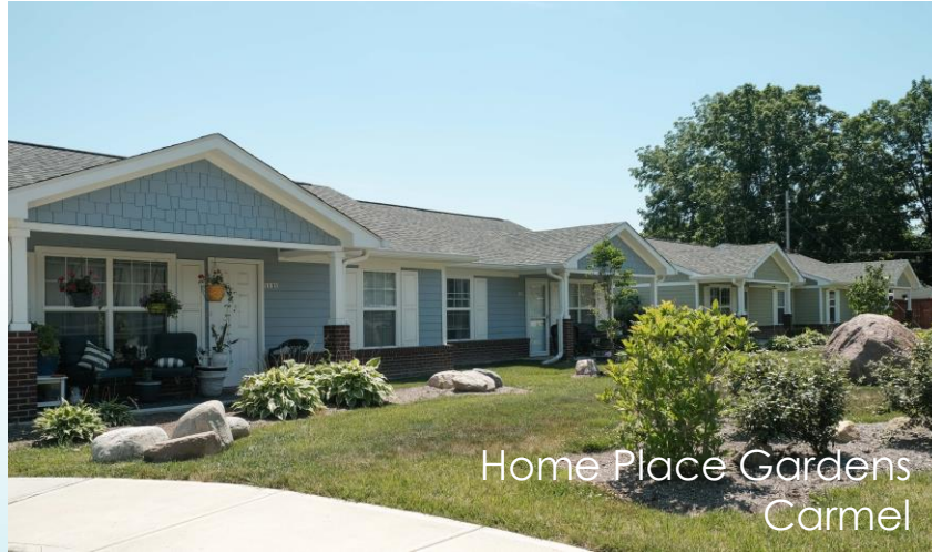
Home Place Gardens Carmel