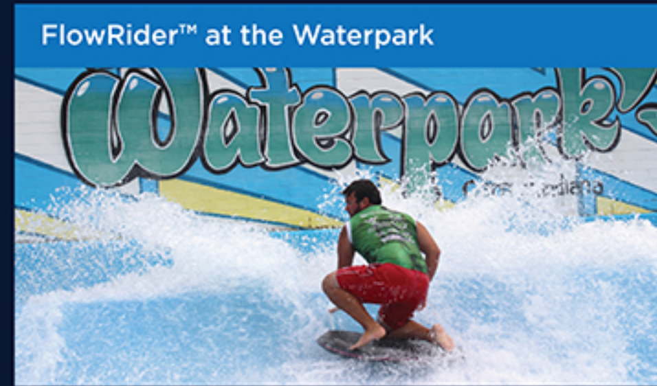
FlowRider™ at the Waterpark