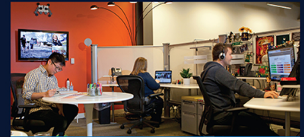
Diverse Professional Opportunities