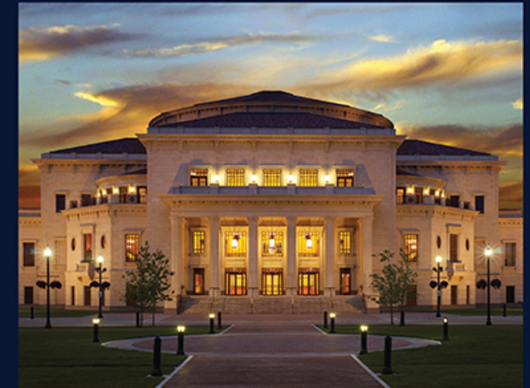
World-Class Entertainment at the Palladium