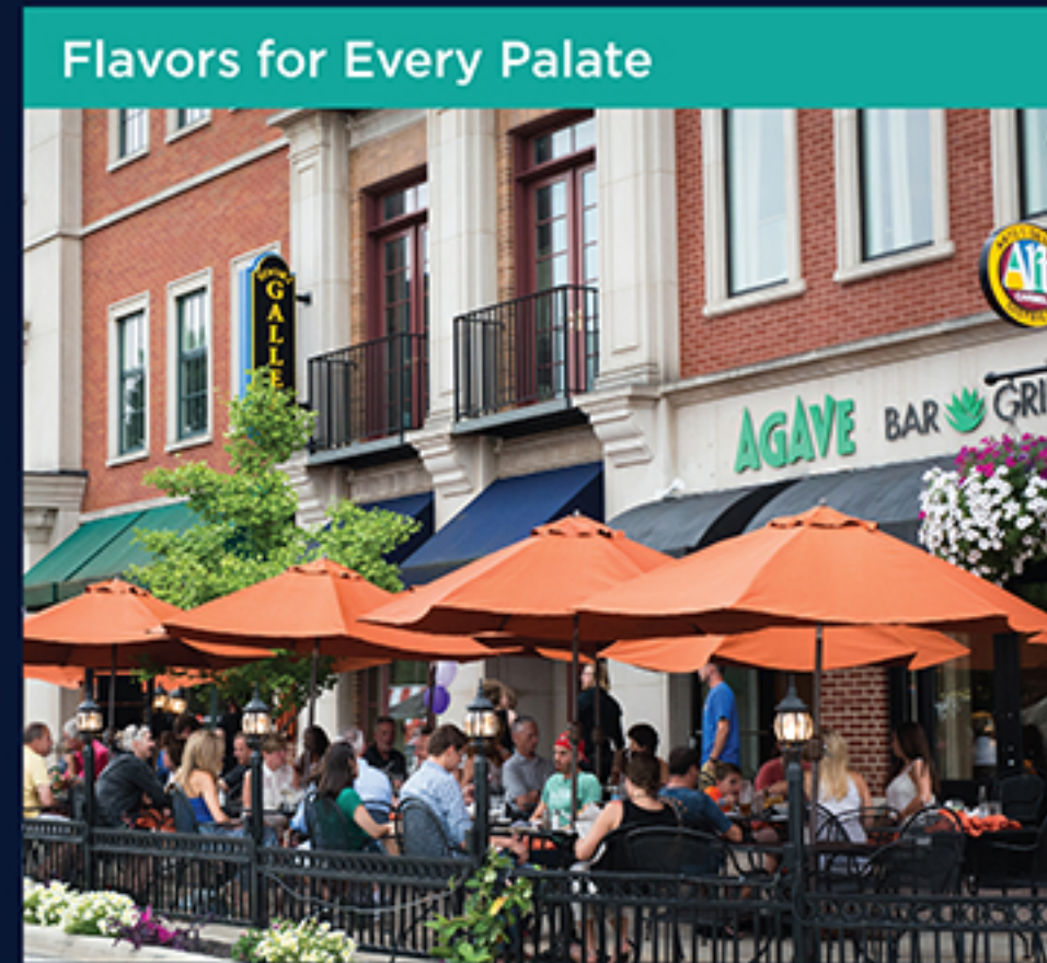
Flavors for Every Palate