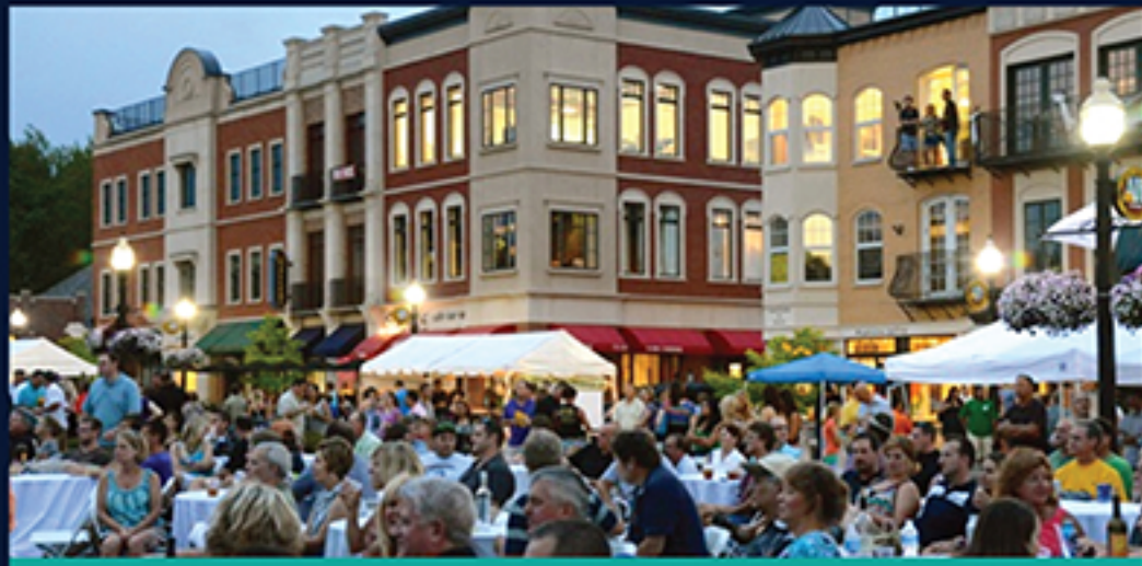
Wine Festival in the Arts & Design District