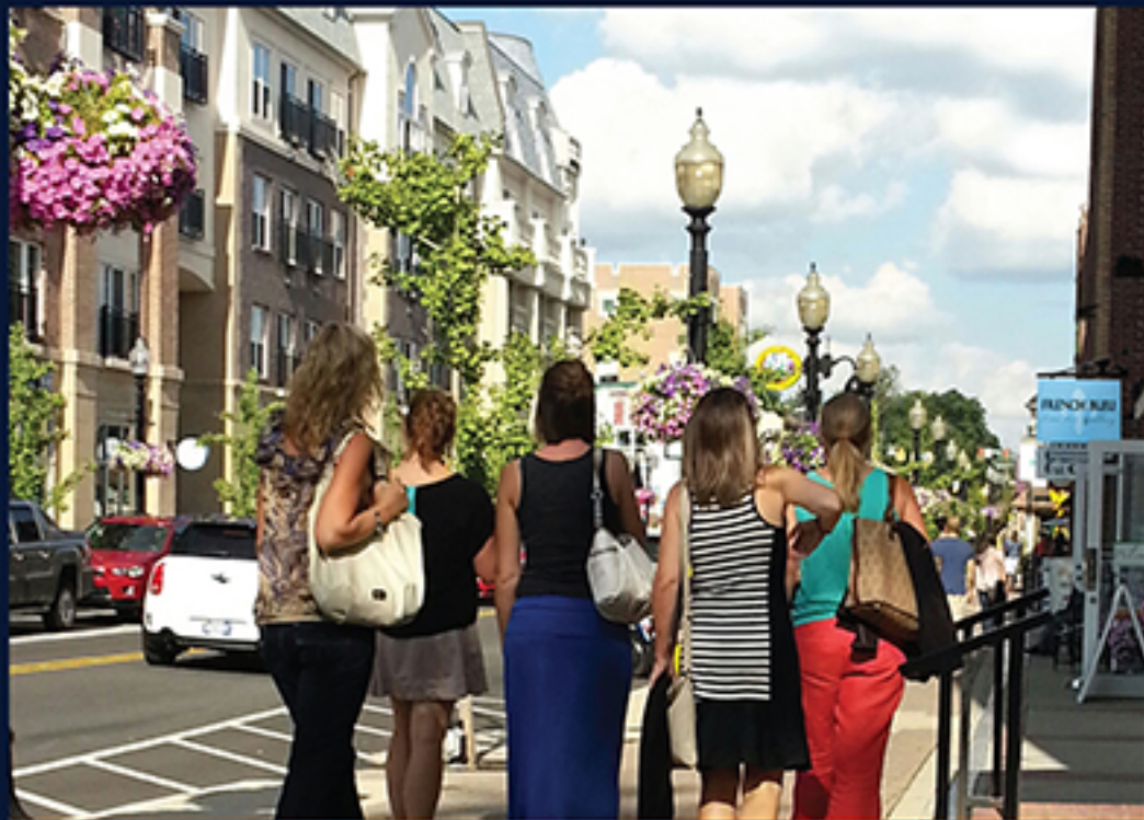
Shop Local in our Walkable Downtown