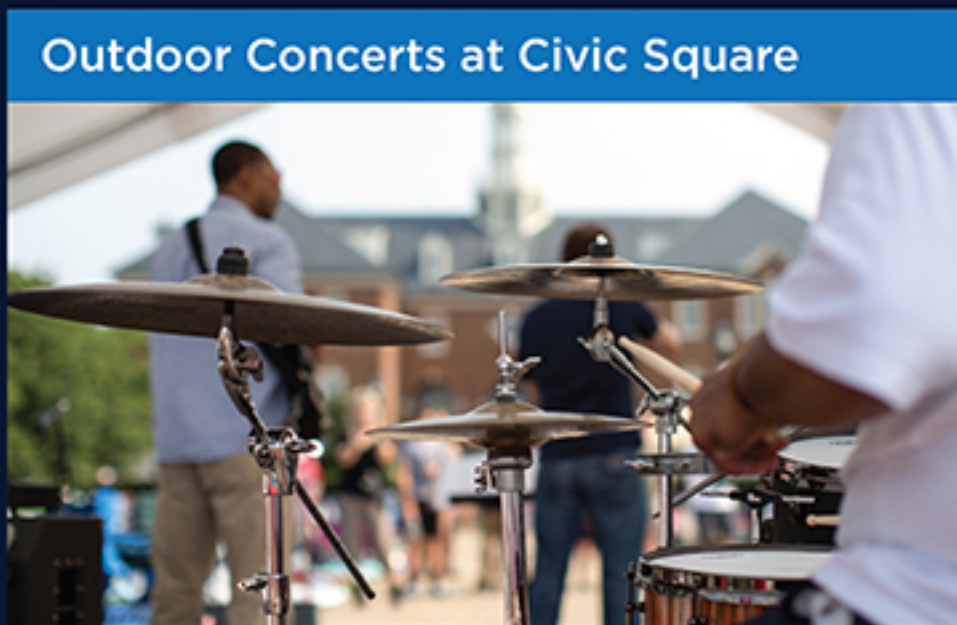
Outdoor Concerts at Civic Square