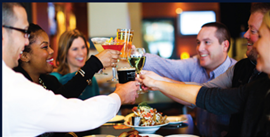
Nightlife at Carmel City Center