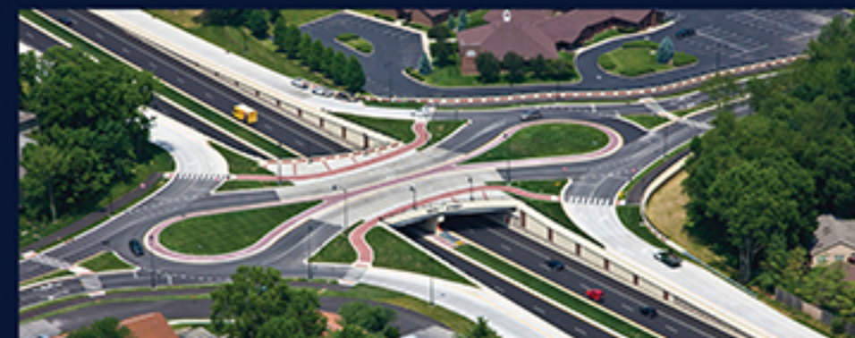
Roundabout Capital of the U.S.