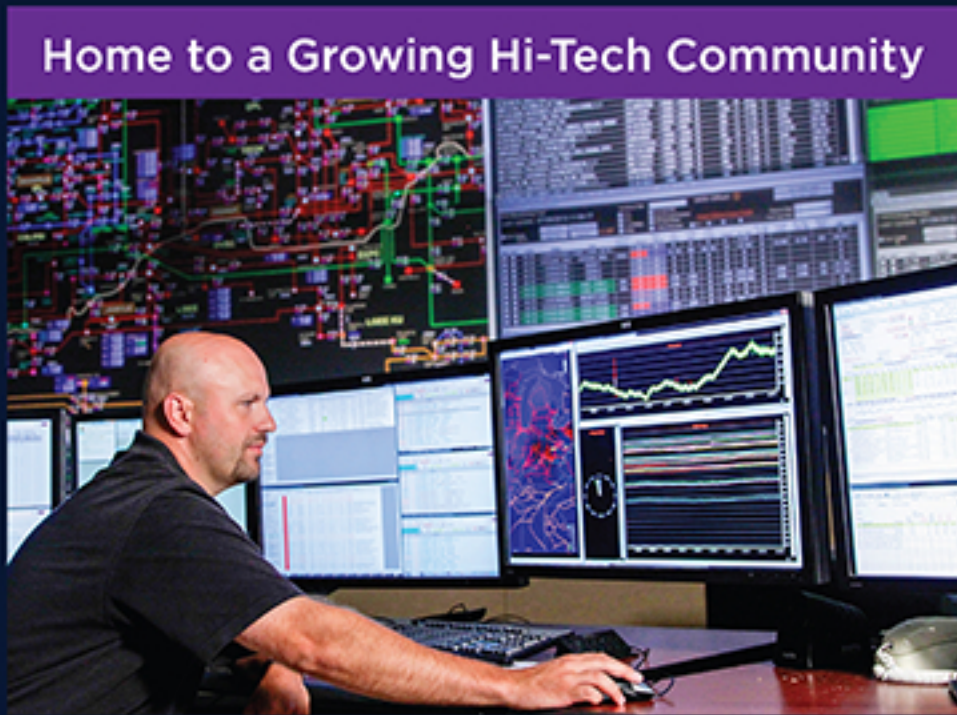
Home to a Growing Hi-Tech Community